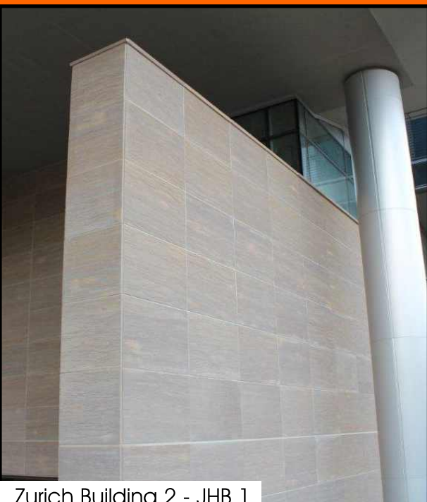
Zurich Building 2 - JHB 1