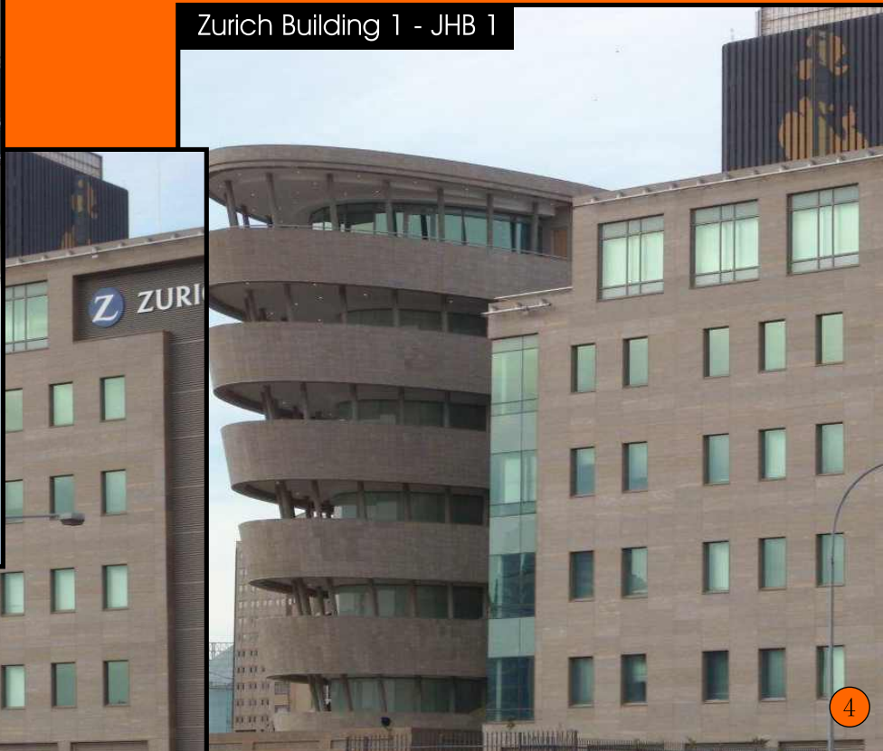
Zurich Building 1 - JHB 1